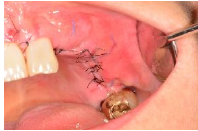
Wound after 5 days blue ® m oral gel