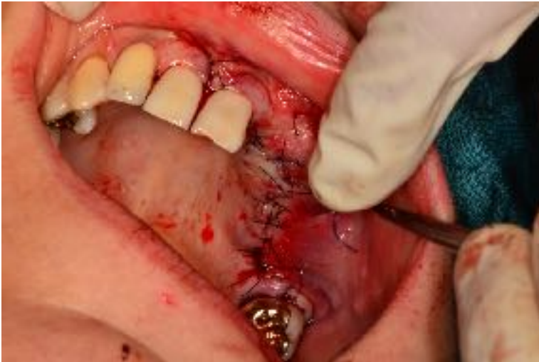
Wound directly after surgery

blue ® m, for the protection of injured periodontal tissue