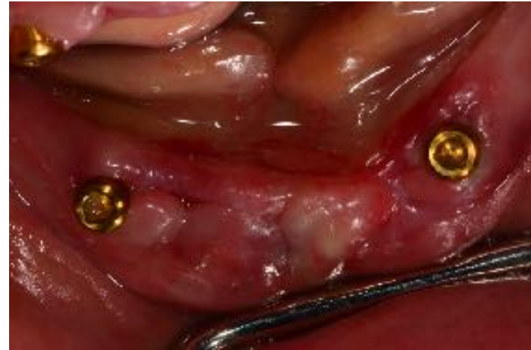
1 month post-operative